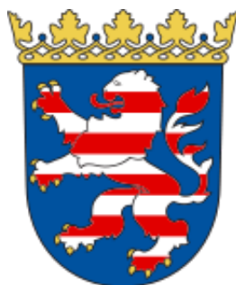
Federal State of Hesse (Germany)