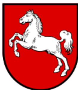
Federal State of Lower Saxony (Germany)