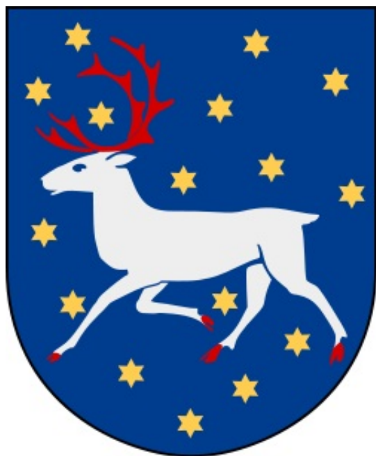
Västerbotten County (Sweden)